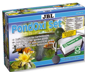
JBL PondOxi-Set Aeration set with air pump for garden ponds