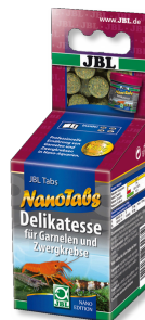
JBL NanoTabs Main food for shrimp and dwarf crayfish