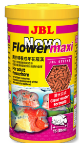
JBL NovoFlower maxi Complete food for Flowerhorn cichlids from 12 cm upwards