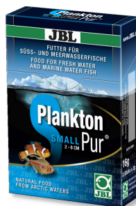
JBL PlanktonPur SMALL Treats for small aquarium fish