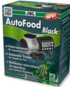
JBL AutoFood BLACK Black automatic feeder for aquarium fish