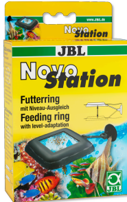
JBL NovoStation Floating feeding ring with water level adaption