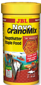
JBL NovoGranoMix Main food for medium-sized and large aquarium fish