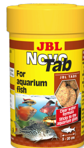
JBL NovoTab Main food tablets for all aquarium fish