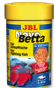
JBL NovoBetta Complete food for labyrinth fish, e.g. fighting fish