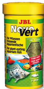
JBL NovoVert Main food flakes for plant-eating fish