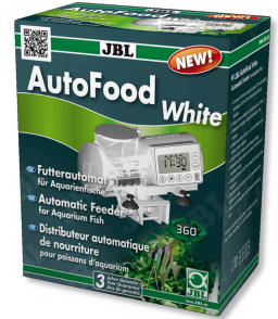
JBL AutoFood WHITE White automatic feeder for aquarium fish