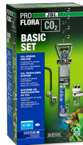
JBL PROFLORA CO2 BASIC SET M CO2 fertil. system basic compl. set f. aquarium plants