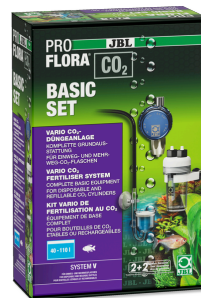
JBL PROFLORA CO2 BASIC SET V CO2 fertiliser system (NO BOTTLE!) for aquarium plants