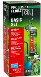
JBL PROFLORA CO2 BASIC SET U CO2 fertil. system basic compl. set f. aquarium plants