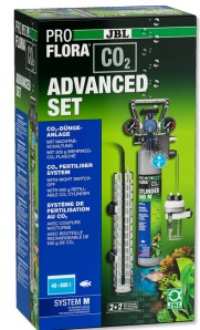
JBL PROFLORA CO2 ADVANCED SET M CO2 plant fertilis. system compl. set+night switch-off