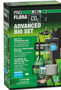
JBL PROFLORA CO2 ADVANCED BIO SET Bio-CO2 fertiliser system for freshw. tanks (40-110 l)