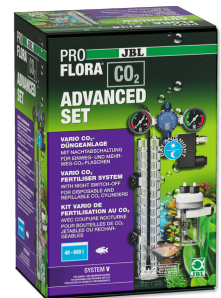
JBL PROFLORA CO2 ADVANCED SET V CO2 system (NO BOTTLE!) with gauges & solenoid valve