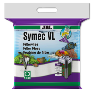
JBL Symec VL Filter wool fleece to remove water cloudiness