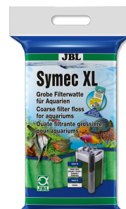
JBL Symec XL Coarse filter wool to remove all types of water cloudiness