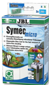
JBL Symec micro Microfibre fleece against water cloudiness