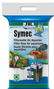
JBL Symec Filter floss Filter wool to remove all types of cloudiness