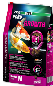
JBL PROPOND GROWTH M