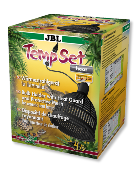
JBL TempSet Heat Install. kit with ceramic bulb holder for heat radiator