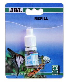
JBL pH Test 7.4-9.0 pH test in aquariums and ponds in the range 7.4-9.0