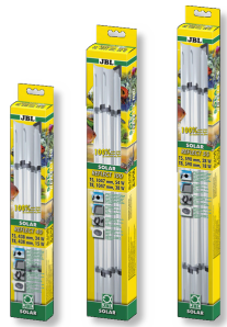
JBL SOLAR Reflect T5/ T8 - 895-1500 mm Reflector panel for fluorescent tube