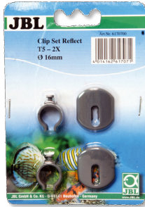
JBL SOLAR REFLECT Clip Set Holder for fluorescent tubes