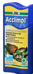
JBL Acclimol Water conditioner for acclimatisation