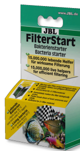
JBL FilterStart Bacteria for the activation of filters