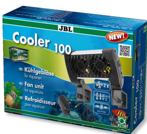
JBL Cooler 100 Cooling fan for fresh- and saltwater aquariums