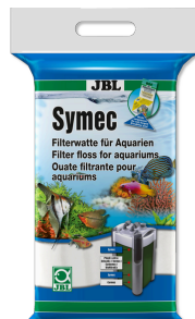
JBL Symec Filter floss Filter wool to remove all types of cloudiness