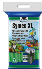
JBL Symec XL Coarse filter wool to remove all types of water cloudiness