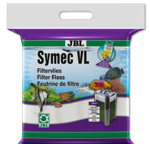
JBL Symec VL Filter wool fleece to remove water cloudiness