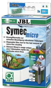
JBL Symec micro Microfibre fleece against water cloudiness