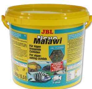
JBL NovoMalawi Main food flakes for algae-eating cichlids