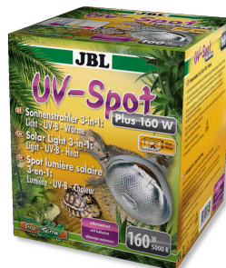
JBL UV-Spot plus UV spotlight with daylight spectrum for terrariums