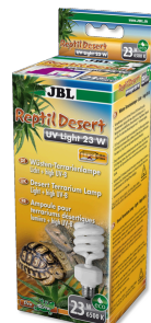
JBL ReptilDesert UV Light Energy-saving lamp for desert terrariums