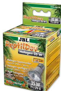
JBL ReptilDay Halogen Halogen spotlight with daylight full spectrum