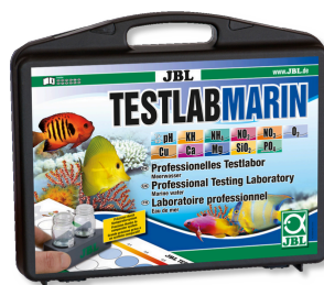
JBL Testlab Marin Professional test case for the analysis of saltwater