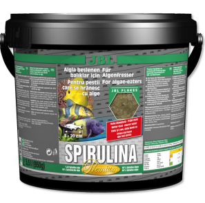
JBL Spirulina Premium main food for algaeeating aquarium fish

You can find a complete overview here: https://www.jbl.de/qr/30190