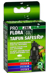
JBL PROFLORA CO2 TAIFUN SAFESTOP Water backflow protection for CO2 systems