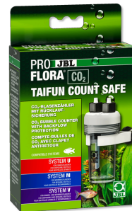
JBL PROFLORA CO2 TAIFUN COUNT SAFE CO2 bubble counter with built-in check valve