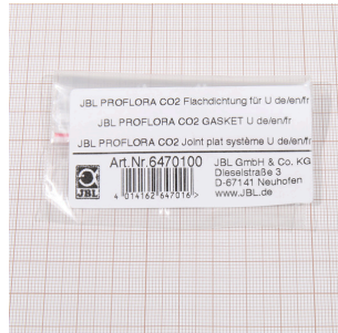
JBL PF CO2 flat gasket for u