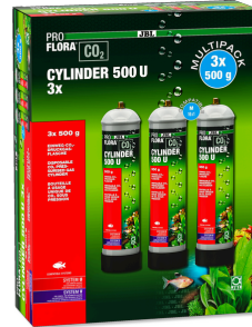
JBL PROFLORA CO2 CYLINDER 500 U 3x 500g disposable CO2 storage cylinder (value pack of 3)