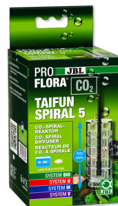
JBL PROFLORA CO2 TAIFUN SPIRAL 5 Expandable CO2 reactor for freshwater aquariums