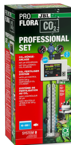
JBL PROFLORA CO2 PROFESSIONAL SET U CO2 plant fertiliser complete set + CO2/pH control