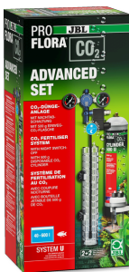
JBL PROFLORA CO2 ADVANCED SET U CO2 plant fertil. system compl. set + night switch-off