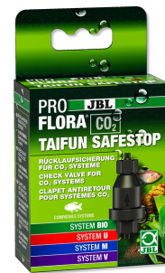
JBL PROFLORA CO2 TAIFUN SAFESTOP Water backflow protection for CO2 systems