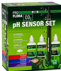
JBL PROFLORA CO2 pH SENSOR SET pH electrode, labor. quality for almost all pH devices