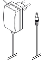
JBL ProTemp Cooler x200/x300 power supply unit