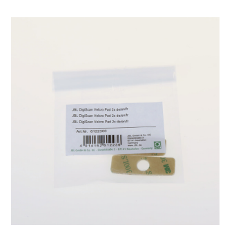
JBL DigiScan Velcro Pad, 2x