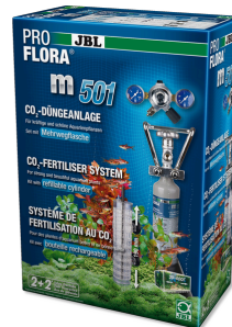
JBL PROFLORA m501 CO2 plant fertiliser system complete kit