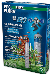
JBL PROFLORA u502 Plant fertiliser system with night switch-off