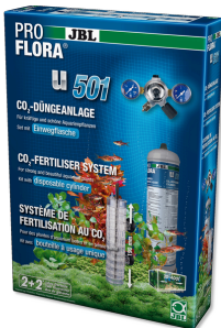
JBL PROFLORA u501 Plant fertiliser system complete kit