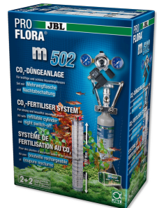
JBL PROFLORA m502 CO2 plant fertiliser system with night switch-off