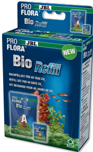
JBL PROFLORA BioRefill Refill set for bio-CO2 systems