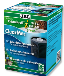
JBL Clearmec CristalProfi i60/80/100/200 Nitrite, nitrate and phosphate eliminator for CP i