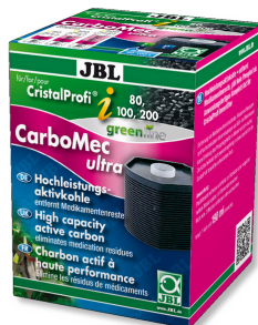
JBL CarboMec ultra Pad CristalProf i60/80/100/200 Filter insert with activated carbon for CP i range