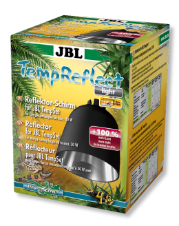
JBL TempReflect light Reflector screen for energysaving lamps