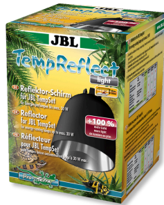
JBL TempReflect light Reflector screen for energy-saving lamps