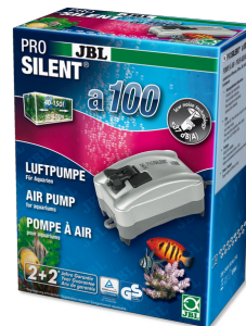
JBL PROSILENT a100 Air pump for fresh and saltwater aquariums