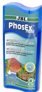
JBL PhosEx rapid Phosphate remover for freshwater aquariums