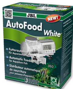
JBL AutoFood WHITE White automatic feeder for aquarium fish