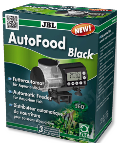
JBL AutoFood BLACK Black automatic feeder for aquarium fish