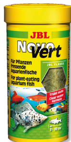
JBL NovoVert Main food flakes for plant-eating fish