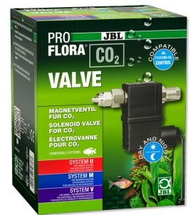
JBL PROFLORA CO2 VALVE CO2 solenoid valve for regulated CO2 addition