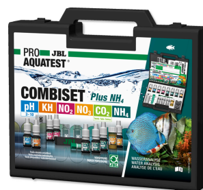
JBL PROAQUATEST COMBISET Plus NH4 Test case with most important water tests + NH4 test