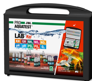
JBL PROAQUATEST LAB Koi Professional test case for koi and garden ponds