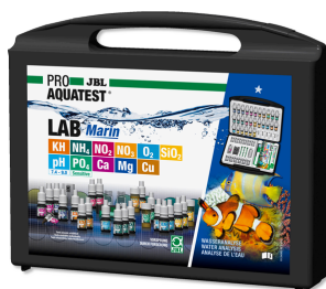
JBL PROAQUATEST LAB Marin Professional test case for marine water analysis