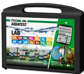
JBL PROAQUATEST LAB Test case with 13 water tests for freshwater analysis