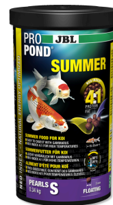
JBL PROPOND SUMMER S Summer food for small koi