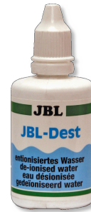
JBL Dest Distilled water to clean pH electrodes