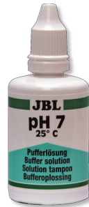
JBL Buffer Solution pH 7.0 Calibration solution with pH 7.0 for pH electrodes