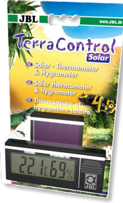
JBL TerraControl Solar Solar-powered thermometer + hygrometer for terrariums