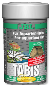
JBL Tabis Premium food tablets for freshwater and marine fish