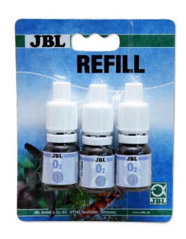
JBL Oxygen Test O2 -New Formula Quick test for the determination of the oxygen content