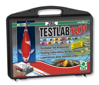
JBL Testlab Koi Professional test case for koi and garden ponds