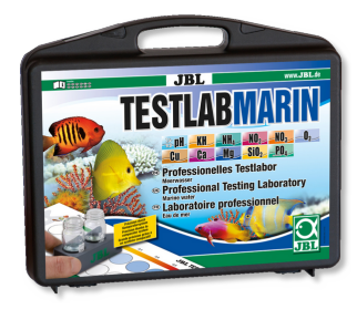
JBL Testlab Marin Professional test case for the analysis of saltwater