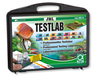
JBL Testlab Test case with 13 tests f. freshwater analysis Testlab