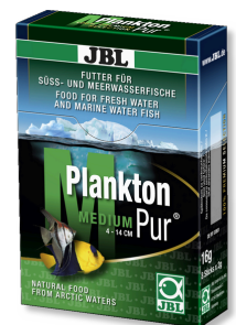
JBL PlanktonPur MEDIUM Treats for large aquarium fish