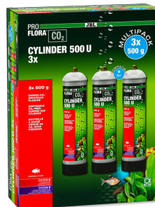
JBL PROFLORA CO2 CYLINDER 500 U 3x 500g disposable CO2 storage cylinder (value pack of 3)