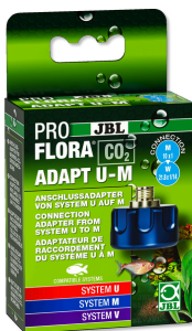
JBL PROFLORA CO2 ADAPT U - M CO2 conversion adapter disposable to refillable bottle