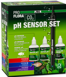
JBL PROFLORA CO2 pH SENSOR SET pH electrode, labor. quality for almost all pH devices