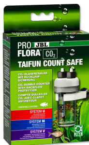
JBL PROFLORA CO2 TAIFUN COUNT SAFE CO2 bubble counter with built-in check valve