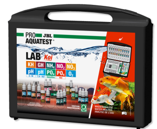
JBL PROAQUATEST LAB Koi Professional test case for koi and garden ponds