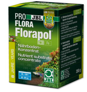
JBL PROFLORA Florapol Long-term nutrient substrate concentrate