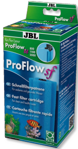
JBL ProFlow sf for u800,1100,2000 Quick filter cartridge for JBL ProFlow pumps