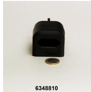
JBL adapter UK for all flat-pin plugs