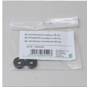
ProFlora u95 flat gasket