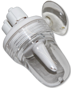
JBL ProFlora u201 bubble counter