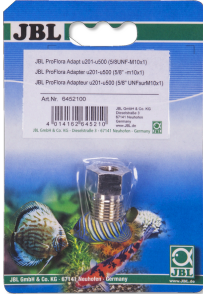
JBL PROFLORA Adapt u201-u500 Adapter for pressure reducer u201