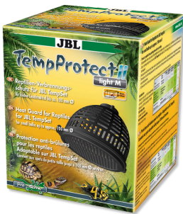
JBL TempProtect II light Reptile thermal burn protection for JBL TempSet items