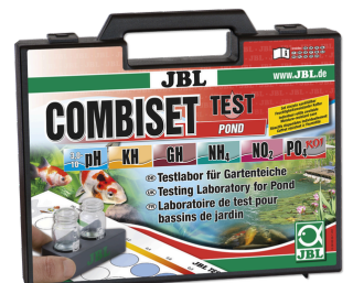
JBL Test Combi Set Pond The most important water tests for garden ponds