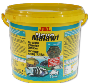
JBL NovoMalawi Main food flakes for algae-eating cichlids